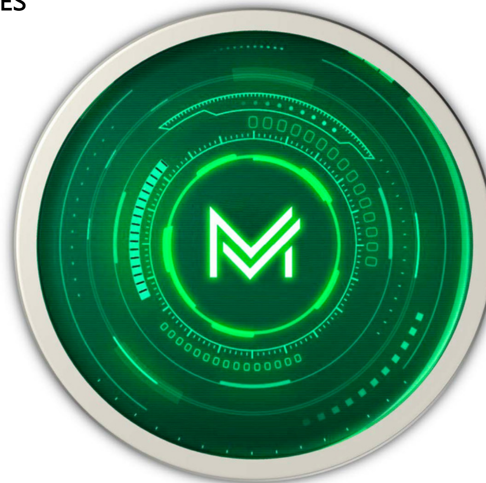
ILLUSTRATION & PRESENTATION SOFTWARE

Automated carrier application and underwriting platform